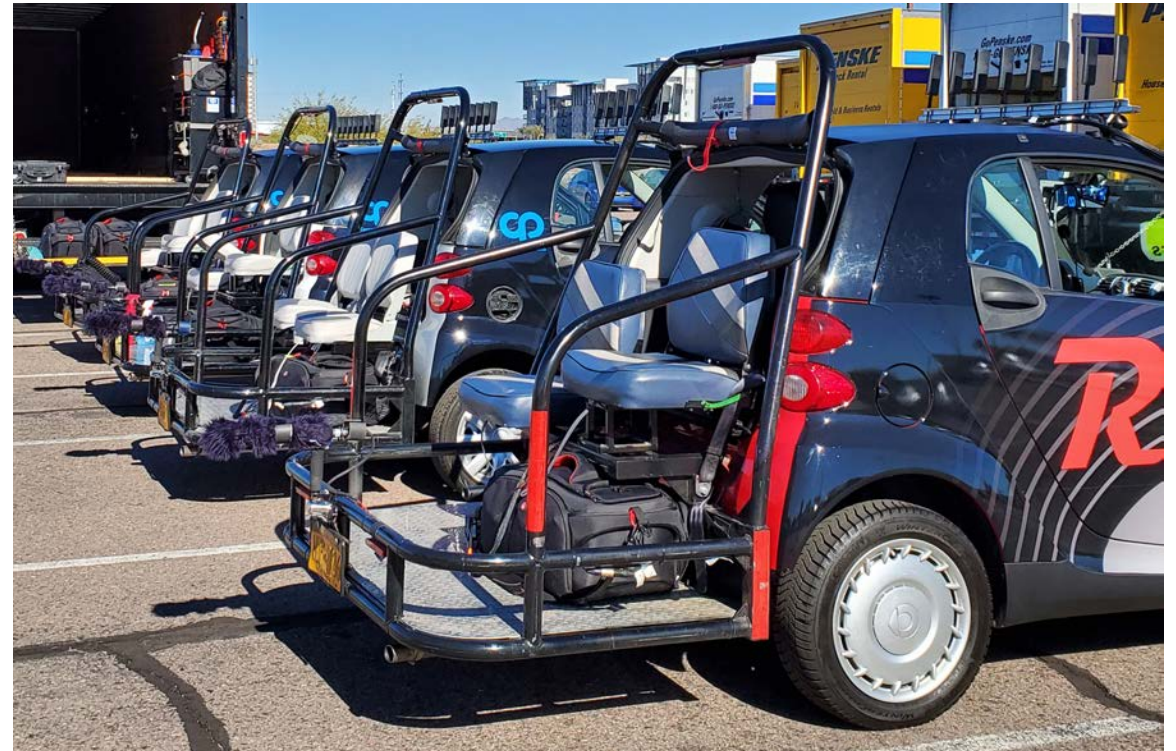
Getting ready in Arizona – January 2020