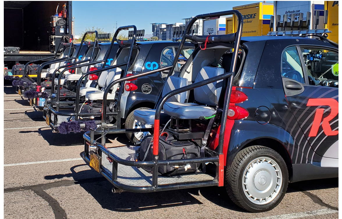
Getting ready in Arizona – January 2020