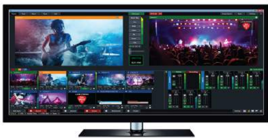
vMix A software-based mixing solution for live productions