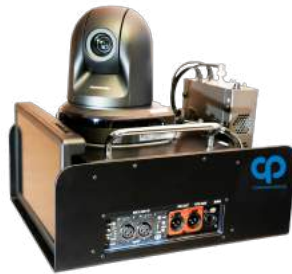
CamSTREAM SRT Now with Haivision SRT for a low-latency solution