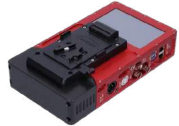
Bonded Cellular Technology Combining the strength of multiple cellular networks to create a robust, reliable, and superfast internet connection for streaming live video