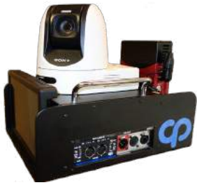
CamSTREAM All-in-one remote production and streaming solution

As a subsidiary of CP Communications, RHS has unique access to innovative technology and experienced professionals. We are dedicated to providing custom glass-to-glass IP production and streaming solutions for every type of live event or recorded programming.