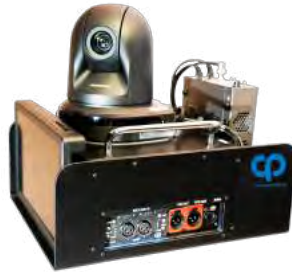
CamSTREAM SRT Now with Haivision SRT for a low-latency solution