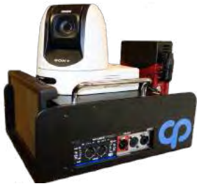
CamSTREAM All-in-one remote production and streaming solution

As a subsidiary of CP Communications, RHS has unique access to innovative technology and experienced professionals. We are dedicated to providing custom glass-to-glass IP production and streaming solutions for every type of live event or recorded programming.