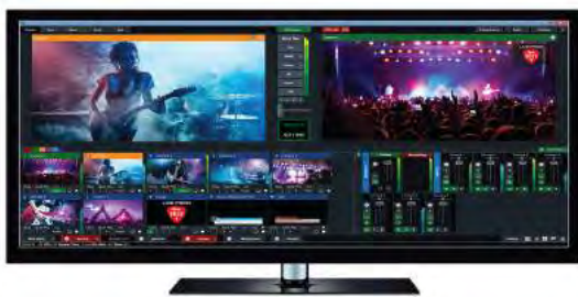
vMix A software-based mixing solution for live productions