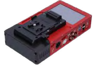
Bonded Cellular Technology Combining the strength of multiple cellular networks to create a robust, reliable, and superfast internet connection for streaming live video